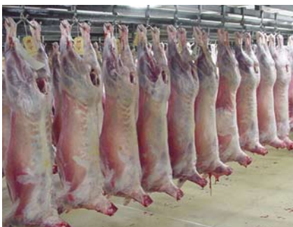
These yield results are a reflection of a high MyoMAX incidence in our Texel and Suftex flocks.

Based on the 2006/07 season's results, 93% of the Genetic Units lambs and 83% of the Stations lambs will potentially receive the new loyalty payment. The beauty of this payment system is its focus on the genetics that produce what the market wants.