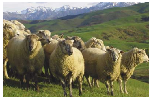
A selection of two-tooth rams available for sale.

Terminal Texel and Suftex rams plus dual purpose Texel sires are available for selection from November. Book now to ensure we meet your ram needs.