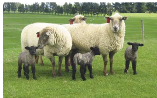
Some of the latest progeny from the flock at Mount Linton.

Electronic identification (EID) eliminates tag reading errors and allows information such as weaning weights to be directly correlated to EID numbers and sent electronically to the appropriate information bureau.